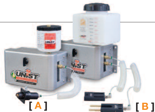
A: The Bat nozzle is easily mountable on band saw or circular saw housing.

Without the need for flood coolant on its saws, TTX not only doesn't need to deal with unruly residue but also less lubrication overall. Before adopting a Unist system,